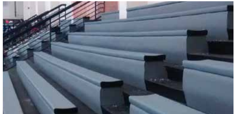
Seats shown featuring optional front facade.